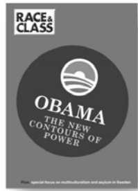
RACE & CLASS OBAMA THE NEW CONTOURS OF POWER Plus: Special Focus on multiculturalism and empire in America

Race & Class is a quarterly journal on racism, empire and globalisation, published by the Institute of Race Relations, London.