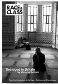
RACE & CLASS Besieged in Britain by Victoria Brittain Plus: the Distribution of the Paper • Zionism and Oriental Jews