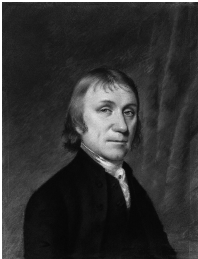
Fig. 1. Joseph Priestley (1733–1804), by Ellen Sharples.

languages because of his broad knowledge of French, Italian, and German, and his liberal leanings increased. He wrote an English grammar (9) that still makes enjoyable reading with its rigorous analytical style. He also produced several essays on the importance of a liberal education with an emphasis on its development. Another strong interest was electricity, particularly its history, and he published a 700-page book titled The History and Present State of Electricity (10) that went through five editions and translations into French and German. He made several discoveries in this area, including the conductivity of charcoal, and he proposed that electrical force was similar to Newton's gravitational force in following an inverse square law.