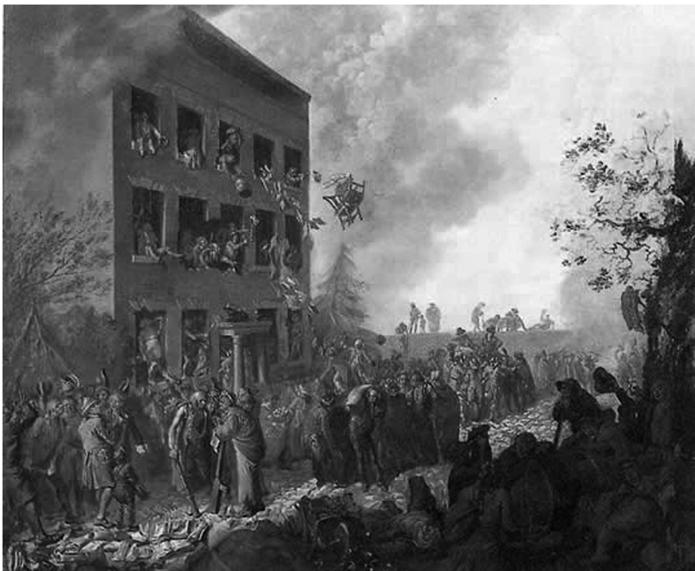
Fig. 2. Rioters Burning Dr. Priestley's House at Birmingham, 14 July 1791 (1791), by Johann Eckstein. From the Susan Lowndes Marques Collection.

because he had previously produced a gas that had some of the same properties but was water soluble. This was nitric oxide ( \text{NO} ), which oxidized to nitrogen dioxide ( \text{NO}_2 ). Next he placed a candle in the new gas and reported in his immortal statement “but what surprized me more than I can well express, was, that a candle burned in this air with a remarkably vigorous flame . . . I was utterly at a loss how to account for it” (Fig. 4). He also reported that “a piece of red-hot wood sparkled in it . . . and was consumed very fast” (14).